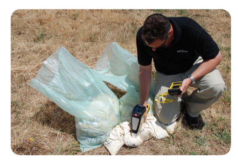
Drill Chip Pre-Screening