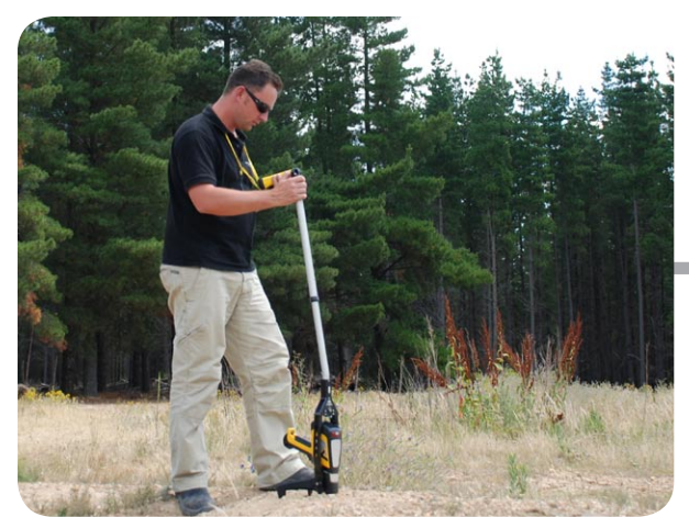
In-situ Soil Analysis with Soil Stick